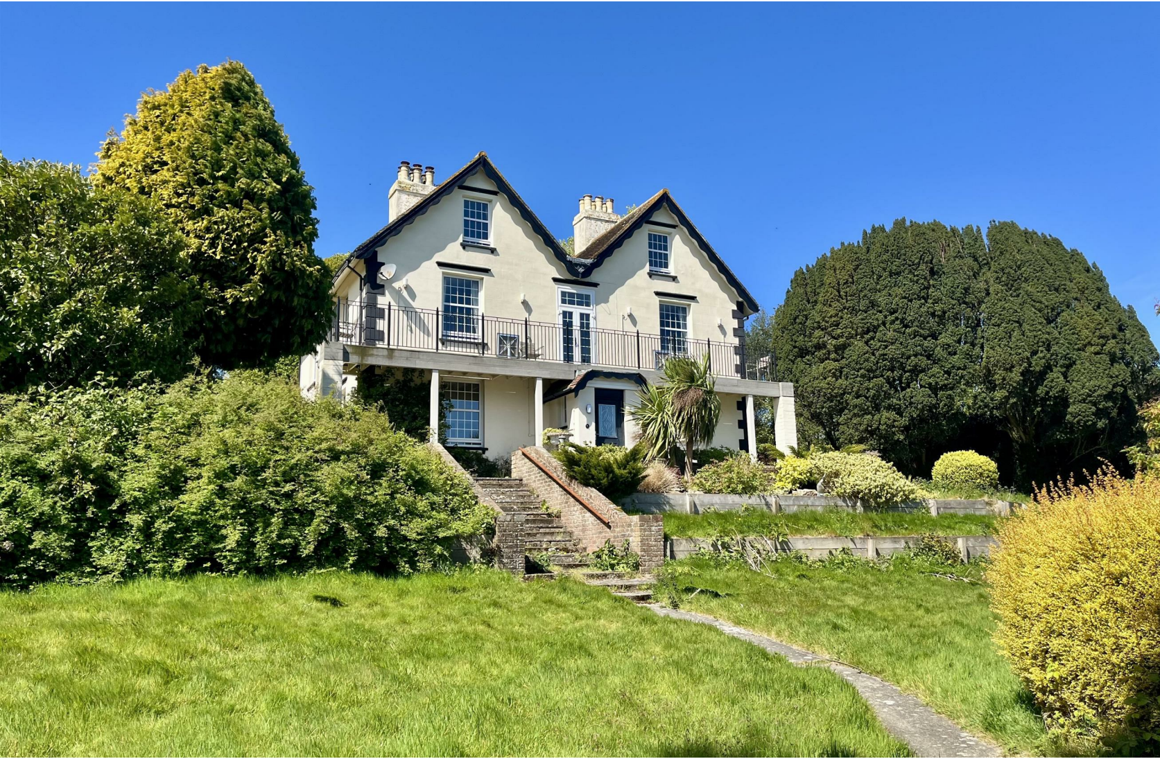
Fairlight Cottage Warren Road, Fairlight, TN35 4AG