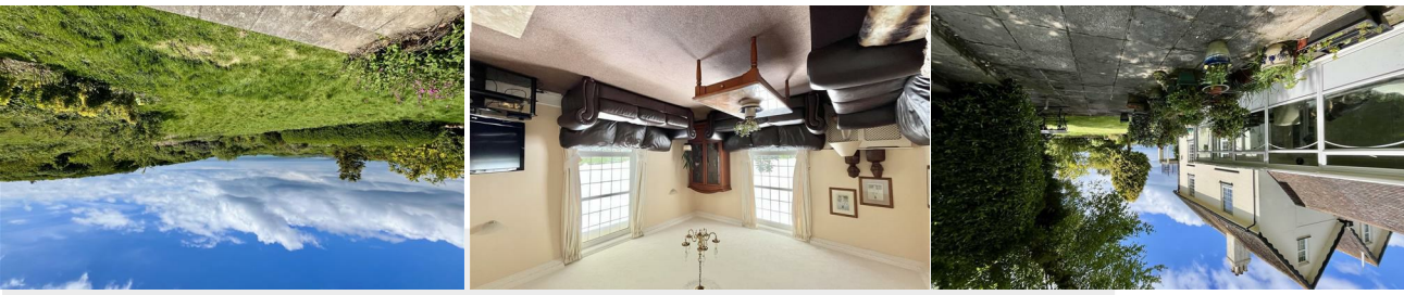
Fairlight Cottage Warren Road, Fairlight, TN35 4AG